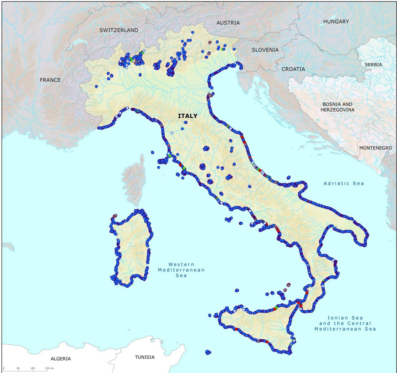
Map 1: Bathing waters reported during the 2015 bathing season in Italy