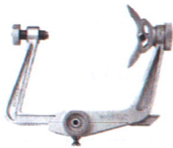
MAYFIELD® Modified Skull Clamp (A1059)

Integra LifeSciences Group is voluntarily reinforcing the MAYFIELD® Skull Clamps, A1059, A1108, A1114, A1117, A2000, A2114, A3059 Instructions for Use and intending to emphasize the current MAINTENANCE and recommended FREQUENCY associated with the safe use of the MAYFIELD® Skull Clamps, listed below: