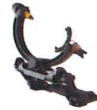
MAYFIELD® MR/X-ray Skull Clamp (A1117)