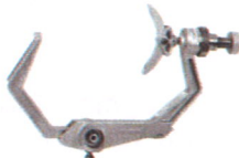
MAYFIELD® 2000 Skull Clamp (A2000)