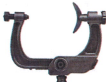
MAYFIELD® Infinity XR2 Skull Clamp (A2114)