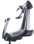
MAYFIELD® Triad Skull Clamp (A1108)