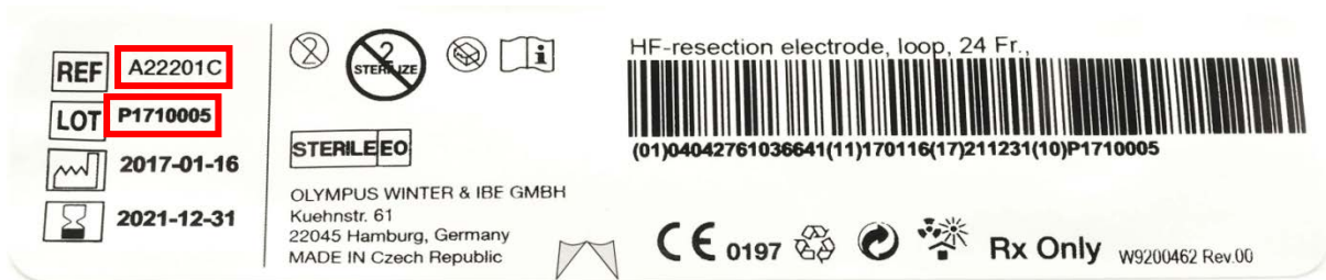
Picture 7: model (REF) and lot (LOT) number on the blister packaging label