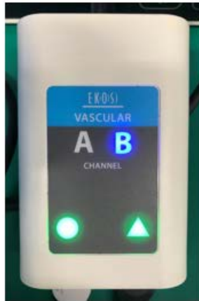
Figure 1 (a) Correct orientation of CIC label with Channel B running