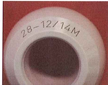
650-0831 item is marked 28 - 12/14 M

PLEASE TAKE DUE NOTICE OF THE REMAINING INFORMATION FOR AN EXPLANATION OF THIS NOTICE: